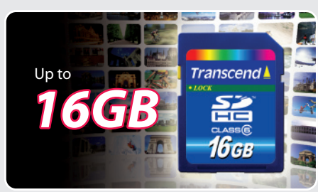
Up to 16GB capacity